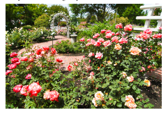
Mother's Day Chosen Spot Plant Expo & Sale at Luther Burbank Home & Gardens

Celebrating all moms! Mothers receive free admission on Mother's Day.