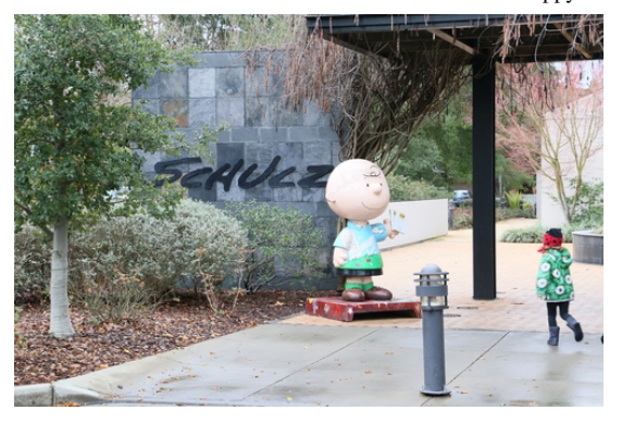
Happy Mother's Day from the Charles M. Schulz Museum